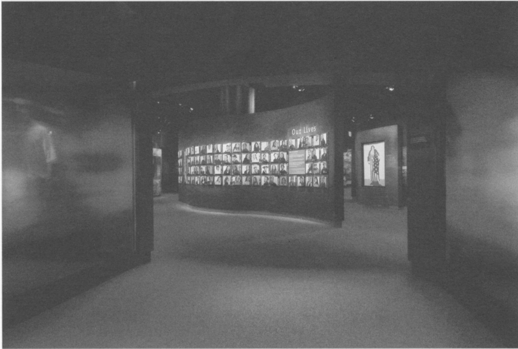
Figure 3. The entryway to “Our Lives” gallery, National Museum of the American Indian.

multiple constructions of history as embedded in every object on display in the museum. The opportunity to read these installations from a multivalent historical perspective is still possible if one recognizes the object as the Indigenous historical text.